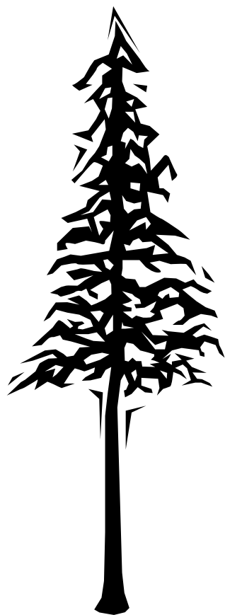
Visit "America's Rain Forests" - http://rainforests.pwnet.org

(3) And the agency is responding to concerned public who say they oppose timber harvesting, particularly clear-cutting.